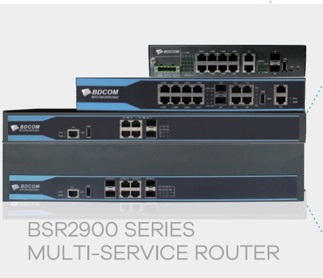
BSR2900 SERIES MULTI-SERVICE ROUTER