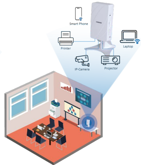
Desk Mount for Meeting Room/SMB