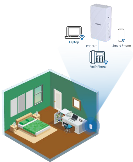
EU/US Junction Box Wall-Plate for Hotel

The EAP104 is an enterprise-grade, concurrent dual-band Wi-Fi 6 indoor wall-plate access point for hospitality, apartment buildings, or MDUs. The EAP104 supports 2x2:2 uplink and downlink MU-MIMO between the AP and multiple clients, with up to 3 Gbps aggregated data rate. The EAP104 is equipped with Bluetooth Low Energy (BLE) radio and ZigBee, enabling value-added applications such as iBeacon. The EAP104 can be operated in a standalone mode or managed by Edgecore ecCLOUD, ecCLOUD-VPC, or an EWS-Series controller.