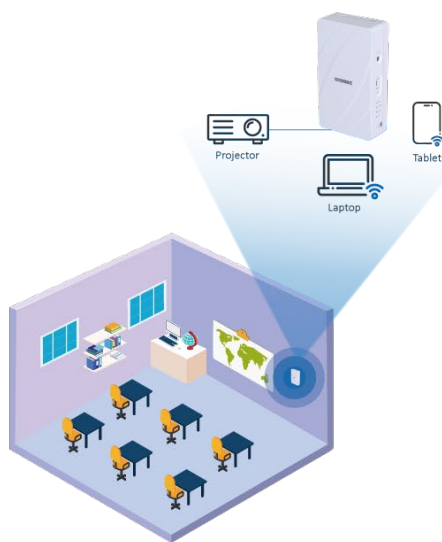
Wall Mount for Classroom