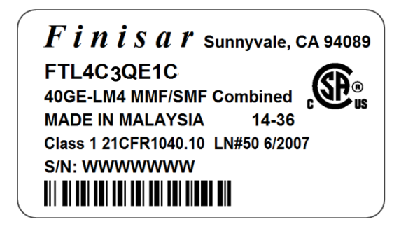
Figure 3 – FTL4C3QE1C label